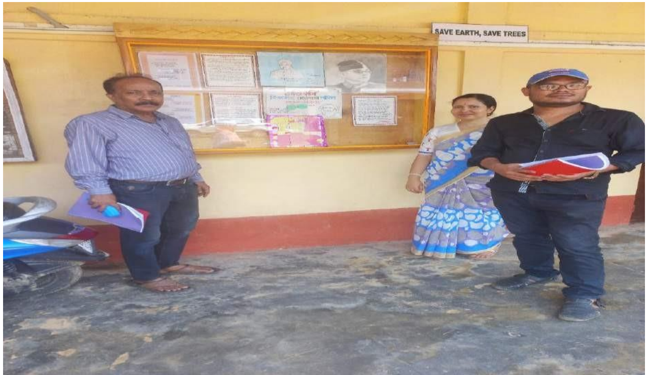
College Wall Magazine